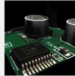
3D AOI after SMD